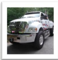
Truckin 4 Troops 2 Tables of Wounded Heroes