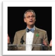
Earl Blumenauer Congressman Democrat Oregon