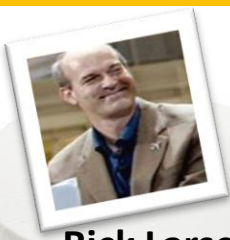
Rick Larsen Congressman Democrat Washington