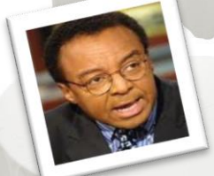
Clarence Page Chicago Tribune Columnist Political Analyst