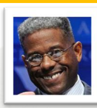
Allen West Congressman Republican Florida