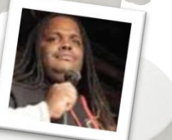
Alabama Outstanding Stand Up Comic