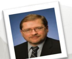
Grover Norquist President of Americans For Tax Reform