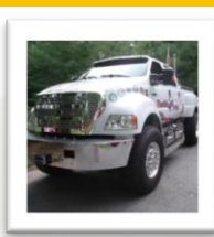
Truckin 4 Troops 2 Tables of Wounded Heroes