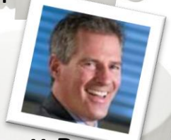
Scott Brown Senator Republican Massachusetts